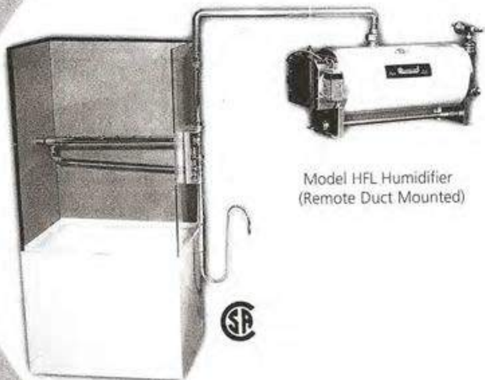
Model HFL Humidifier (Remote Duct Mounted)

Computer Rooms Food Processing Printing plants Residences Hospitals Libraries Offices Etc.